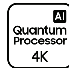
Quantum Processor 4K 1