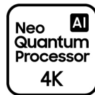
Neo Quantum Processor 4K 1