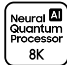
Neural Quantum Processor 8K 1